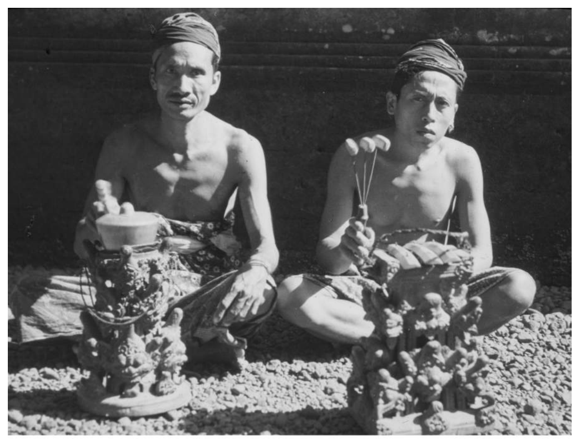
Kelenang and kenyir in the gamelan gambuh of Puri Tabanan