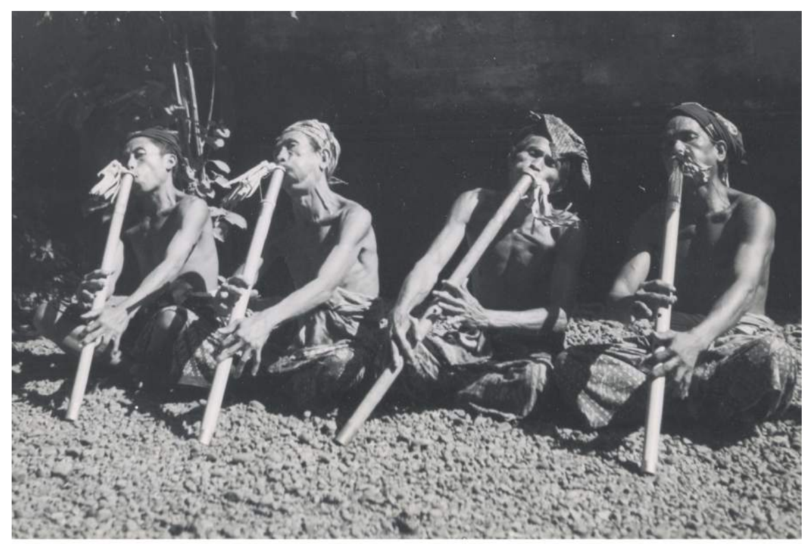
Suling gambuh of Puri Tabanan circa 1931-38