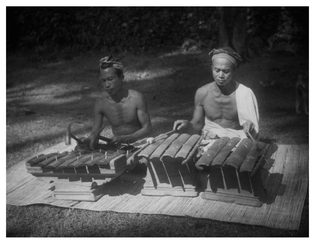
Caruk ensemble in Selat, Karangasem played for temple festivals & death rituals: saron gedé , saron cenik , & caruk (producing 7-tone scale plus the octave) Photo by Colin McPhee circa 1931-38 Courtesy of UCLA Ethnomusicology Archive & Colin McPhee Estate

Given the prominence of céngcéng and kempli (a knobbed kettle–shaped horizontal– positioned gong which functions as beat–keeper as does kajar in other ensembles) in modern kebyar , it is striking that these instruments are rarely heard on the 1928 recordings, possibly on the advice of the recording sessions' producers.<sup>67</sup> But the recently–discovered McPhee and Covarrubias films from the 1930s show kebyar ensembles with kempli as well as two or three musicians playing céngcéng angkep (also called rincik or rincik gedé ), for which each has two cymbals resting on the cymbal stand—facing up— while the musician plays them with another two. This is another of kebyar 's innovations for new compositions as well as traditional lelambatan —a cross between the smaller rincik of gamelan palégongan and the much larger and dominating céngcéng kopyak of gong gedé played by a larger group of musicians each of whom has two big face–up, free–lying cymbals each of which is hit by a matching cymbal.