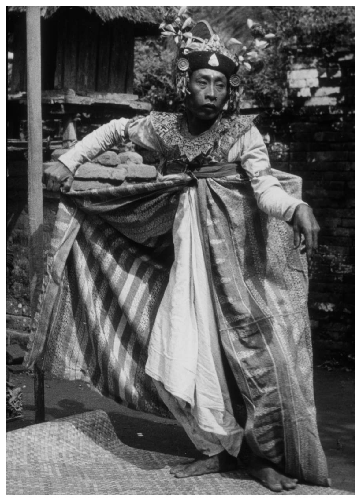
Gambuh of Sésétan; Rangga/Patih Tua (old minister) circa 1931-38