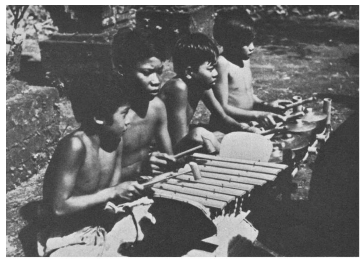
Cungklik (tingklik) and réyong circa 1931-38

Again, the jégogan playing the lower melodic tones plays in irregular patterns, enhancing the flow of melody rather than providing a consistent phrase structure as with other genres. As the pangalihan 'lead-in' repeats at 01:10 and again at 02:25, it is clearly outside the phrase structure of the tabuh 'composition' and without a steady pulse, truly evoking the intended feeling of alih-alih 'searching'.