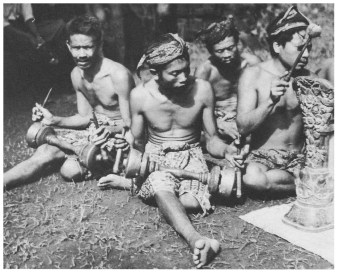
Réyong klénténg in gamelan angklung kléntangan Photo by Colin McPhee circa 1931-38 Courtesy of UCLA Ethnomusicology Archive & Colin McPhee Estate