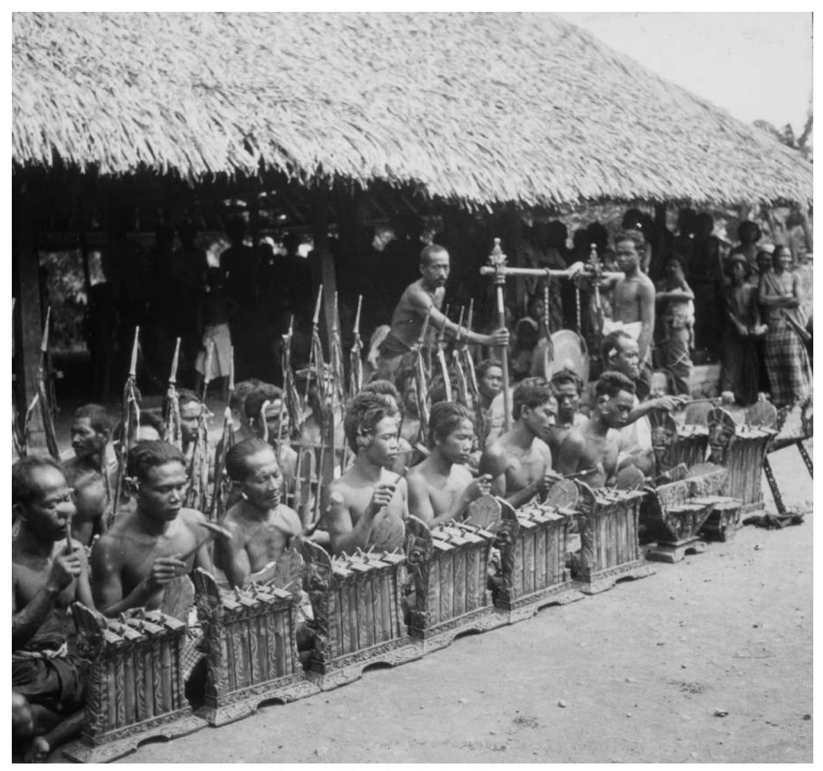
Gamelan angklung kocok of Culik, Karangasem circa 1931-38