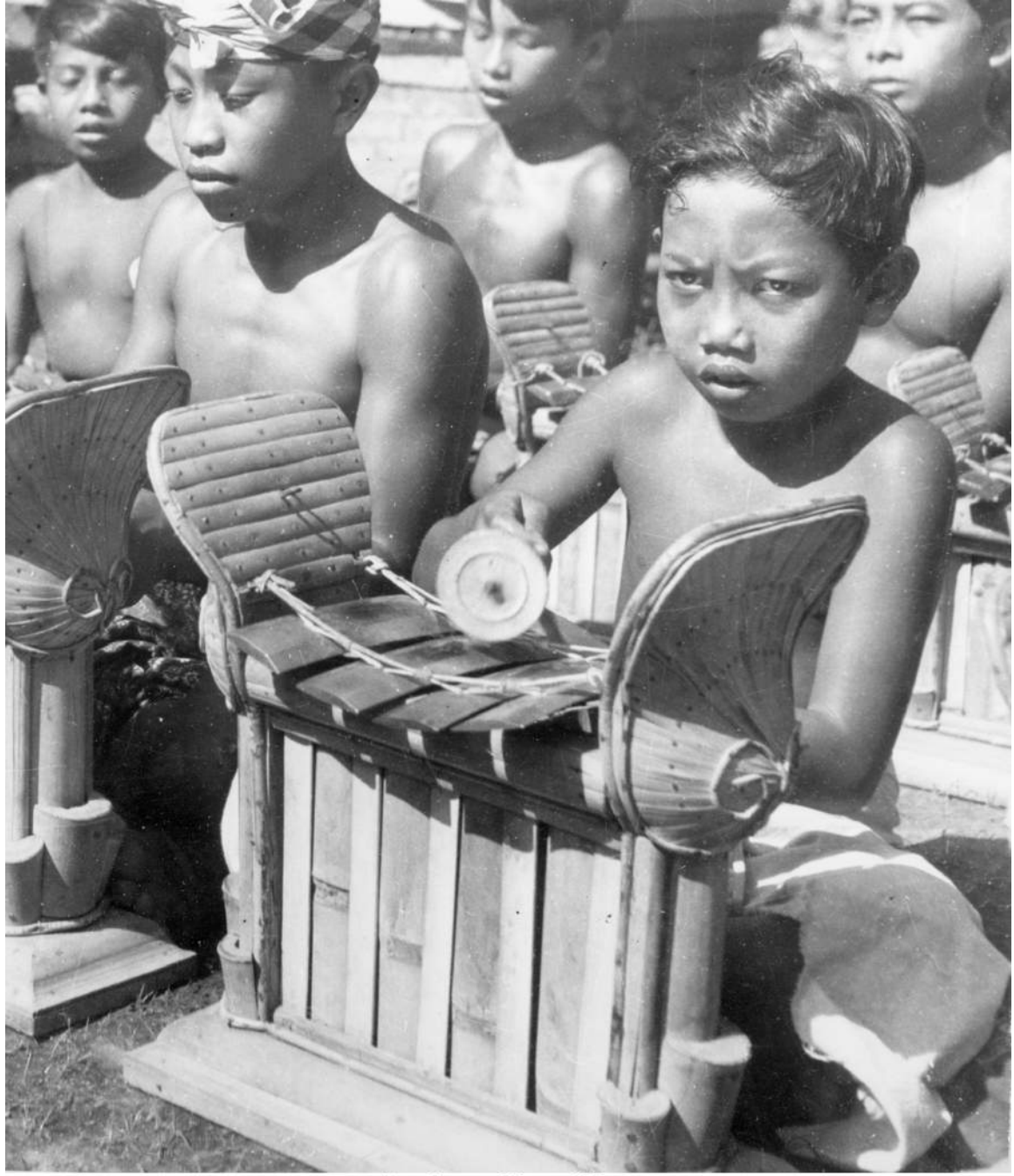
Gamelan angklung of Sayan Kayun playing the pemadé with gendér mallet