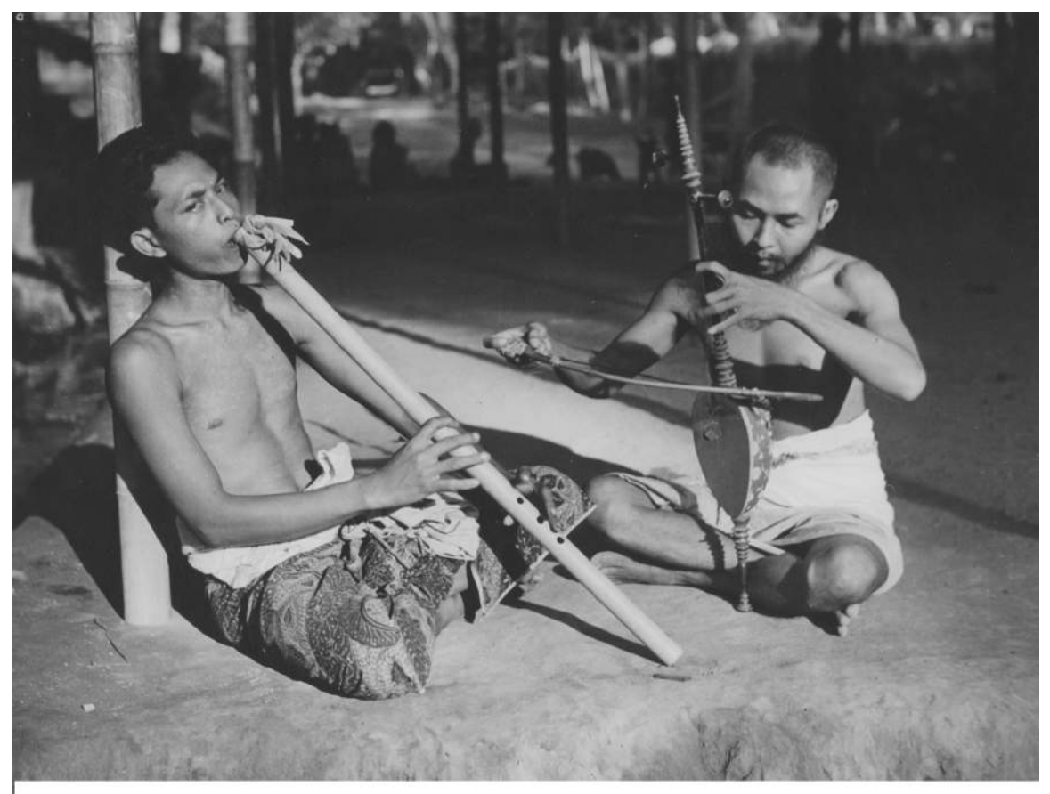
Suling gambuh & rebab in Batuan

Panji: Ih apa-apa kita Prabangsa! Hey, what are you talking about, Prabangsa? Semar: Ih kénkén! Oh, how is that? Panji: Haywa akweh ujar. Yan ajati kita wani! Don't talk so much! If you are really bold against me! Semar: Yan sujati ratu wanén! If you're truly brave! Prabangsa: Énak-énak pukulun, énak! All right, Your Honor, all right!