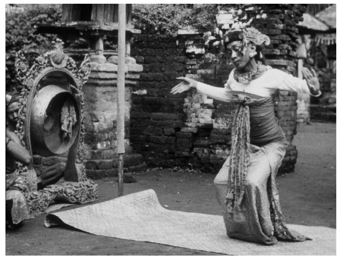
Gambuh of Sésétan; Condong (maidservant) circa 1931-38