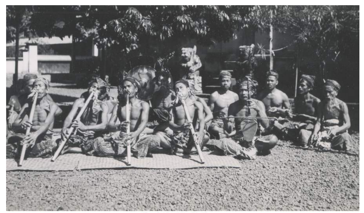
Gambuh of Puri Tabanan From left to right: suling, rebab, gumanak and kangsi