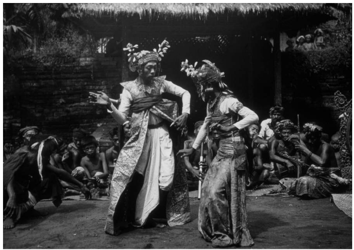
Gambuh of Sésétan; Prabu Manis (refined king), Putri (princess) & Togog (servant) on far left