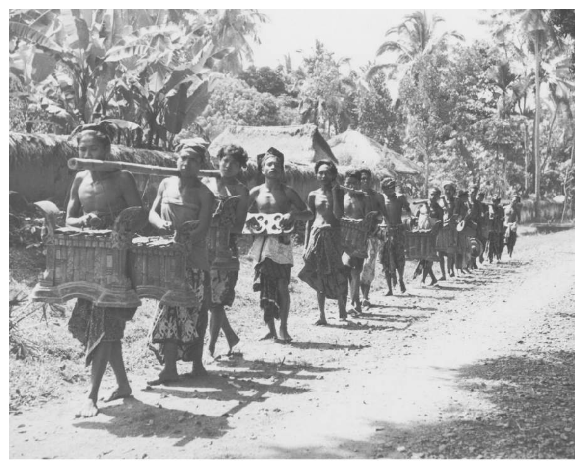
Angklung procession circa 1931-38