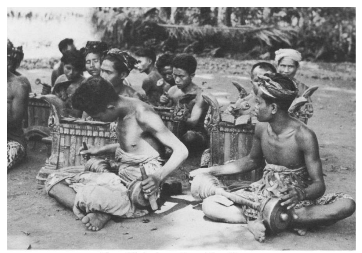
Réyong klénténg in gamelan angklung kléntangan Photo by Colin McPhee circa 1931-38 Courtesy of UCLA Ethnomusicology Archive & Colin McPhee Estate