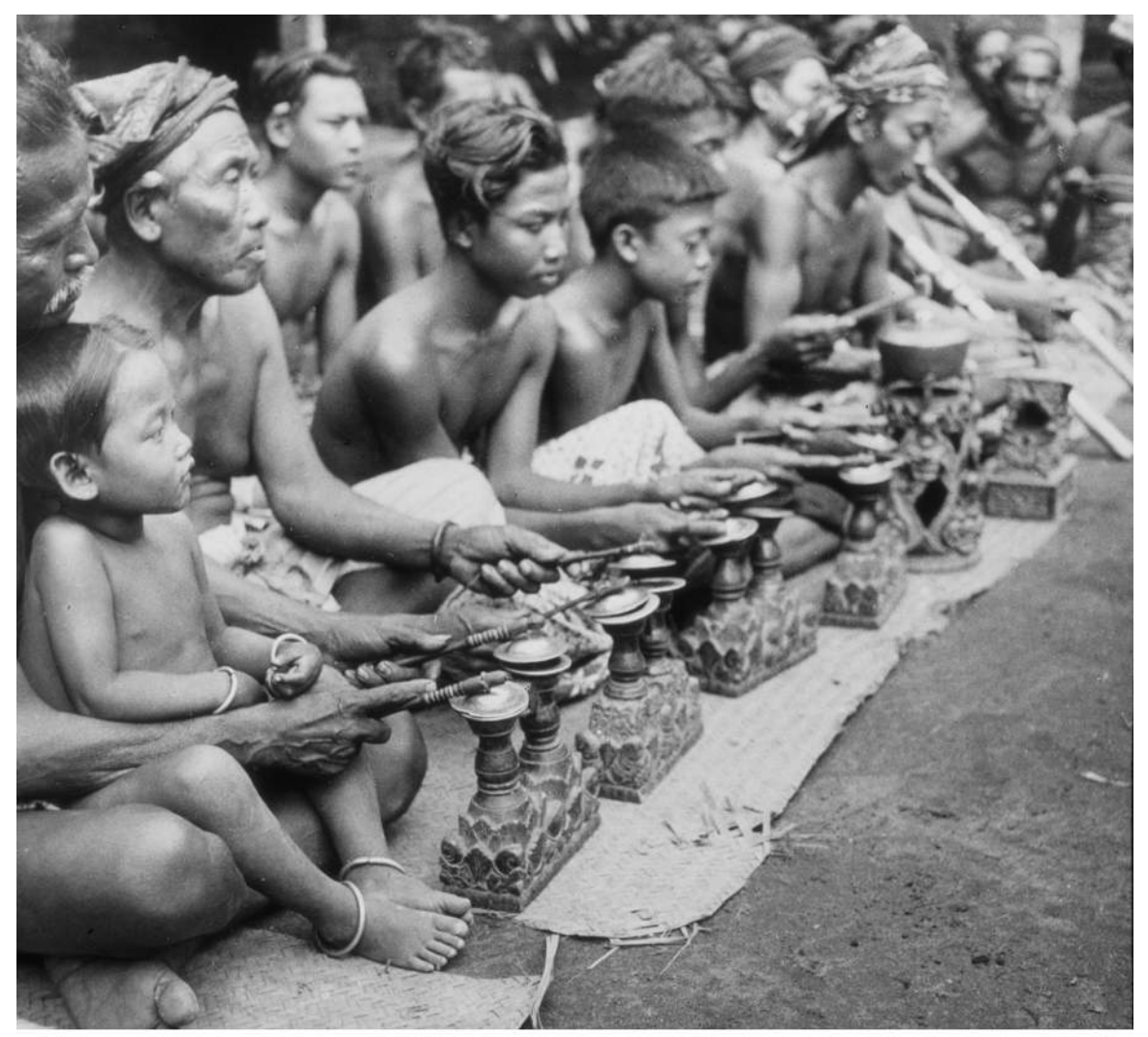
Gamelan gambuh of Sésétan Four sets of rincik, kelenang, & two suling Photo by Colin McPhee circa 1931-38 Courtesy of UCLA Ethnomusicology Archive & Colin McPhee Estate