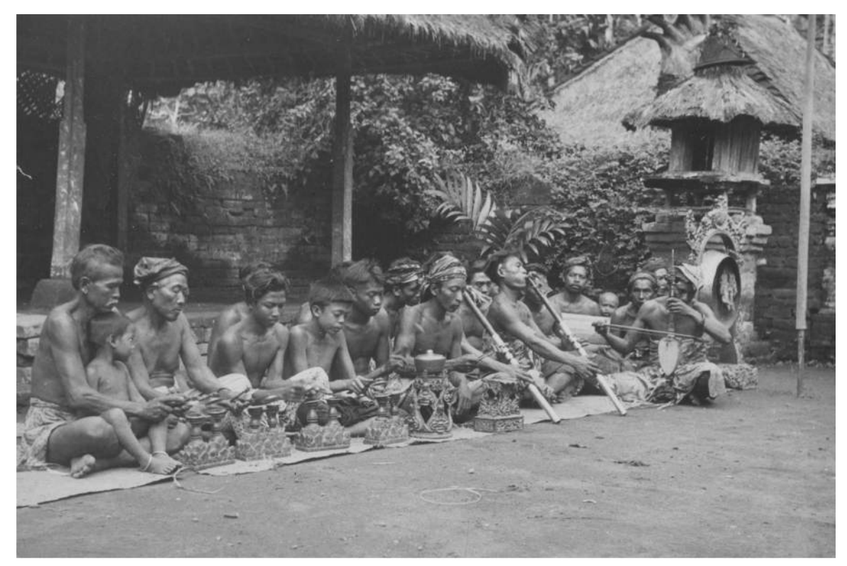
Gamelan gambuh of Sésétan Four sets of rincik, kelenang, kenyir, two suling, kendang, rebab & kempur

Lord Kresna speaks to Yudhistira, also known as Prabu Dharmaputra and Dharmawangsa, concerning the power of King Salia, cousin to the Pandawa clan but obliged to fight on behalf of their enemy cousins. Kresna means to inspire Yudhistira to defeat Salia by telling him to take stock of all the multitudes on the Pandawa side killed by Salia.