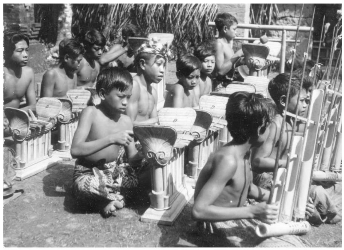
Children's angklung of Sayan, Ubud with bamboo angklung kocok circa 1931-38