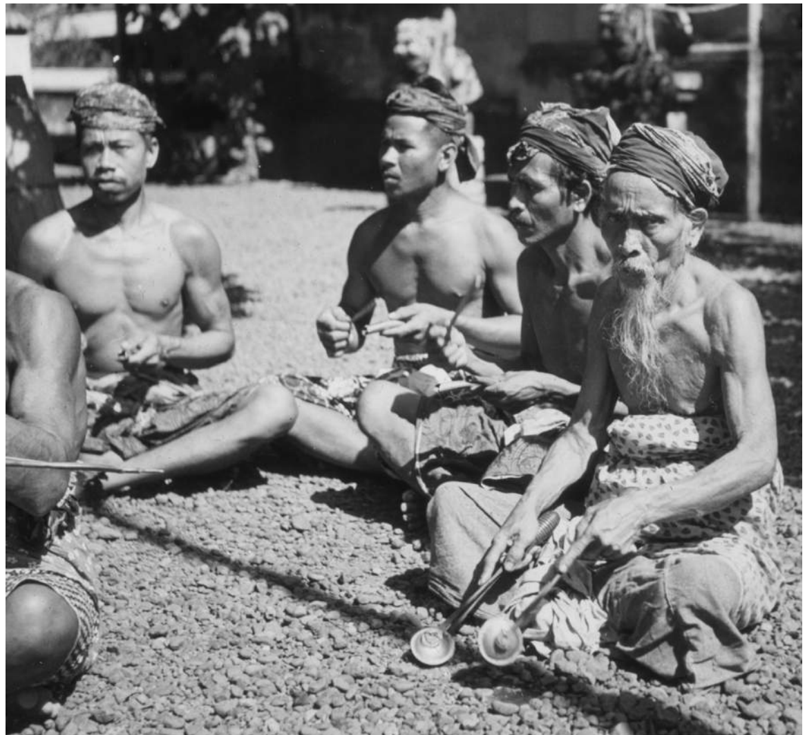
Kangsi and gumanak in the gamelan gambuh of Puri Tabanan