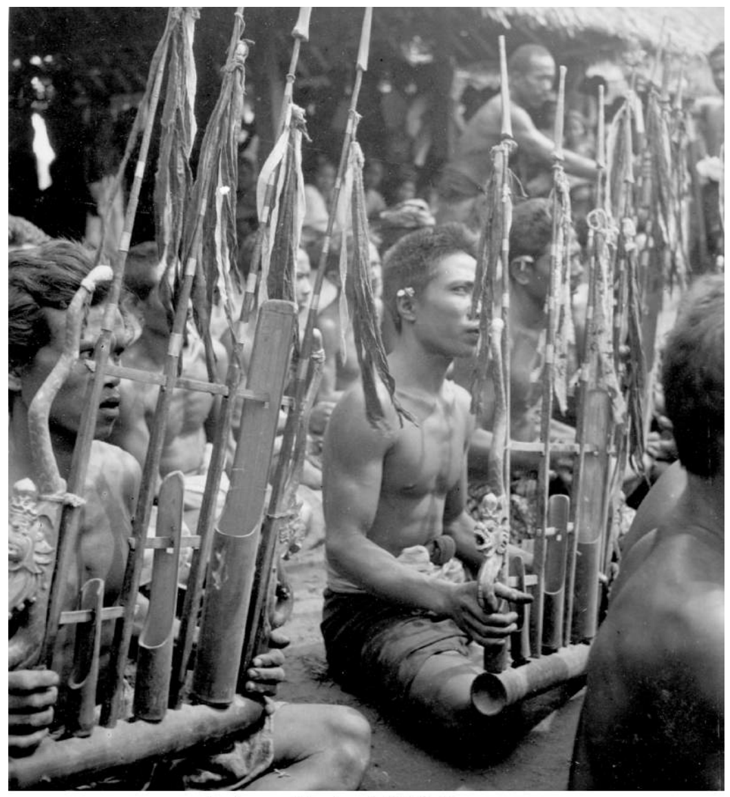
Bamboo angklung kocok of Culik, Karangasem

is interesting how suling are given freedom to deviate from fixed pitches. However, the suling on this rendition goes beyond the norm into the realm of béro , which in vocal music is often prized and appreciated as a display of subtlety when performed with that intention. It is more likely the suling player did not bring his regular flute to the recording session and took a while to adjust to the tuning of the gamelan .